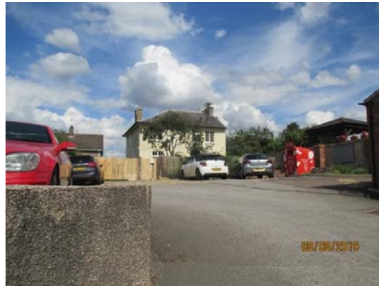
View of the site across the car park, taken from Town Street