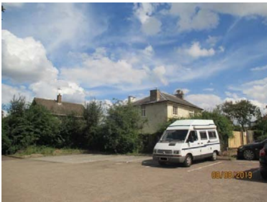
Side of the site, taken from the west of the car park