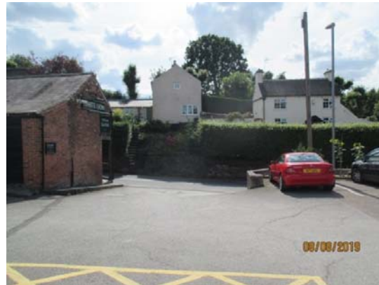
View from the car park toward Town Street