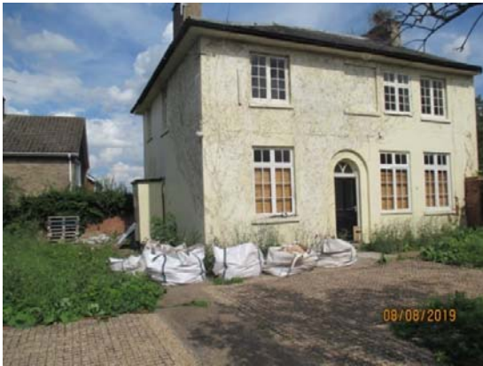
Front elevation of 45 Town Street