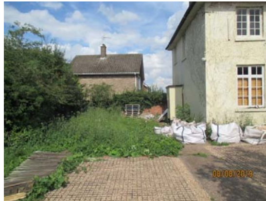
Side garden. 19 St Michael's Square can be seen in the background