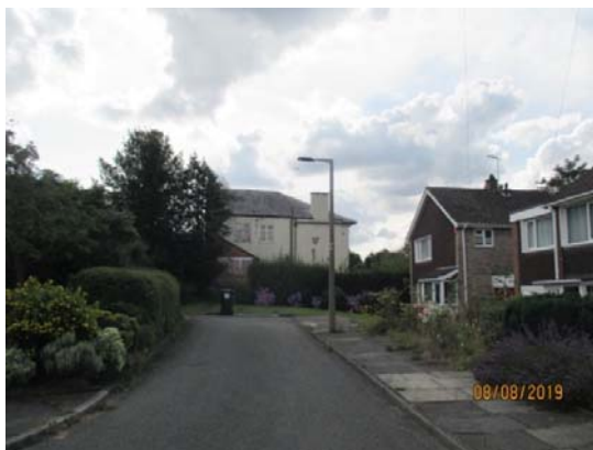
View toward rear of the site from St Michael's Square