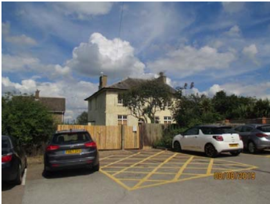
The application site. Access is shown to the front