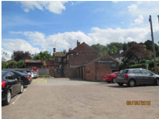
View of the White Lion PH from the car park